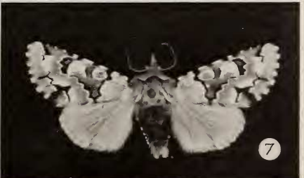
Brenham, 1-IV-79, wing expanse 34.1 mm. 3 , Euxoa pimensis B. & McD., El Paso Co., Tom Mays Park, 24-V-81, wing expanse 41.2 mm. 4 , Eriopyga iole Schaus, Brewster Co., Big Bend Nat'l. Park, Green Gulch, 28-V-81, wing expanse 28.3 mm. 5 , Oncocnemis rosea Smith, El Paso Co., Tom Mays Park, 30-III-83, wing expanse 28.8 mm. 6 , Oncocnemis terminalis Smith, Hemphill Co., Lake Marvin, 9-X-82, wing expanse 35 mm. 7 , Miracavira brillians Barnes, Brewster Co., Big Bend Nat'l. Park, Chisos Basin, 27-VI-65, wing expanse 35.8 mm. (Figures not at same scale. Full wing expanse given for each specimen.)